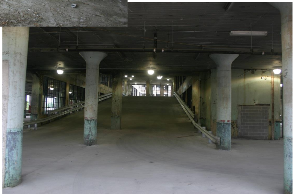
American Standard Interior ramp and topping slab added